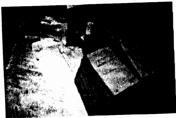
Picture of Nolan's DNA. His DNA evidence consisted of his blood, hair samples, pubic hair samples, and saliva. However, on the chain of custody sheet indicated all but the blood samples.