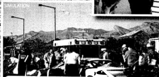
EXHIBIT J Senate Committee on Judiciary