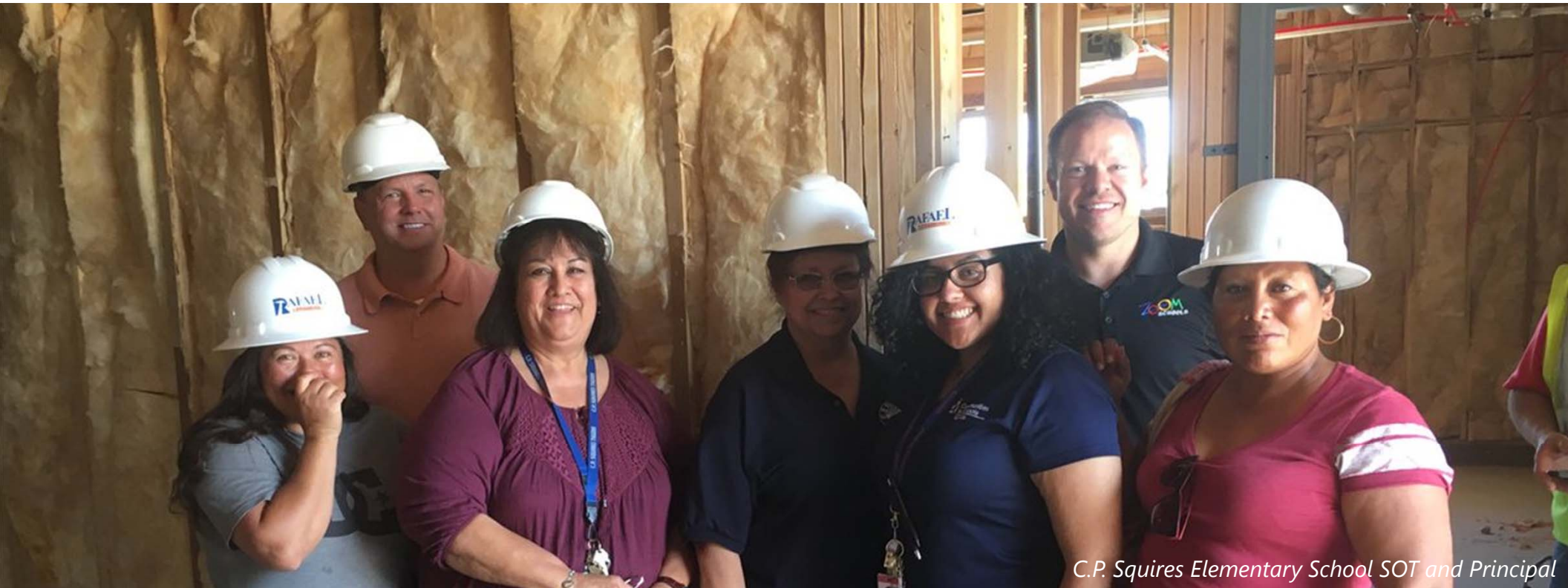
C.P. Squires Elementary School SOT and Principal