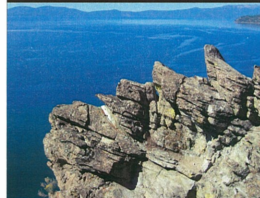
EXHIBIT K - TAHOE Document consists of 2 pages. Entire exhibit provided. Meeting Date: 03-29-10