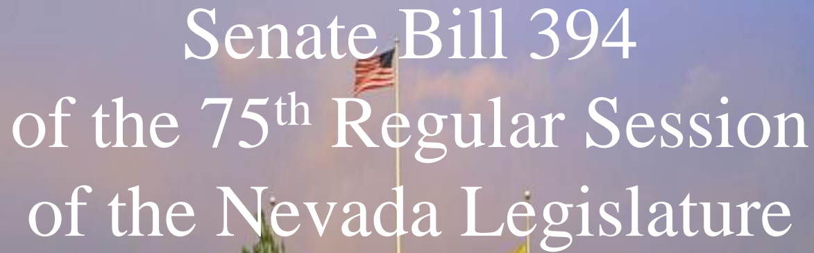
EXHIBIT M – LANDS Document consists of 15 slides. Entire Exhibit provided. Meeting Date: 01-22-10

Makes various changes to provisions relating to off-highway vehicles