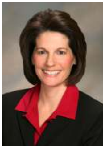
CATHERINE CORTEZ MASTO Nevada Attorney General

Office of the Attorney General Carson City Office 100 North Carson Street Carson City, Nevada 89701-4717 (775) 684-1100 Fax - (775) 684-1108