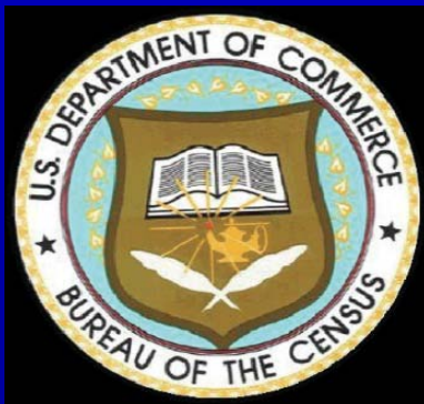
EXHIBIT C – Redistrict Document consists of 13 pages. Entire Exhibit provided. Meeting Date: 12-06-10