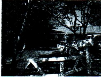
Nevada's Model Re-entry Program