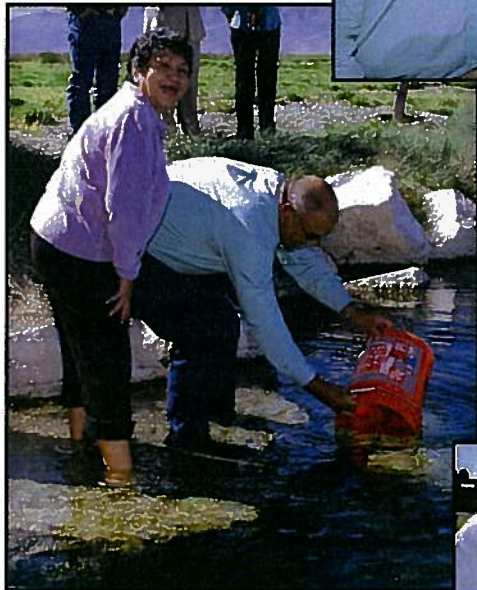
Below- Duckwater Nye County School Children Release Railroad Valley Springfish Into Big Warm Spring

involving the Tribe, the individual tribal business owner, the Service, Nevada Department of Wildlife, Bureau of Land Management, Natural Resources Conservation Service, Bureau of Indian Affairs and the State Water Engineer's Office."