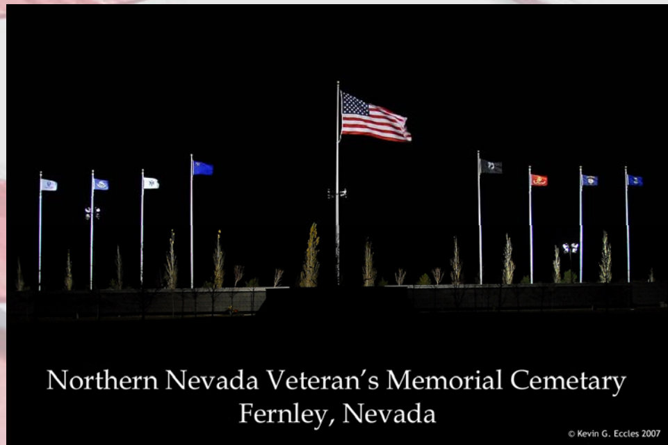
Northern Nevada Veteran's Memorial Cemetery Fernley, Nevada