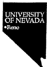
EXHIBIT K Health Care Document consists of 2 pages