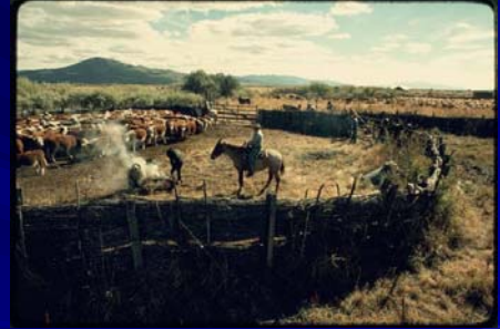
Working ranches are part of the cultural landscape of Nevada