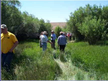
Landowner showing range management workshop participants riparian area being managed under a holistic grazing management plan