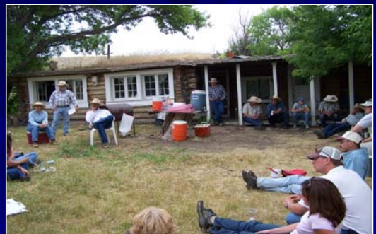
Collaborative conservation means working together to solve today's most pressing environmental problems (eating good food and sharing good company is an incentive !!)