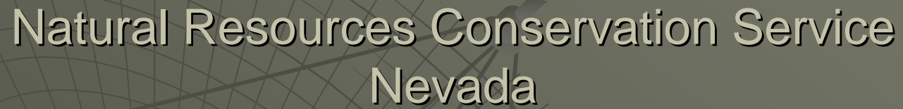
EXHIBIT S - LANDS