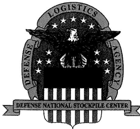
EXHIBIT D-2 Treasures