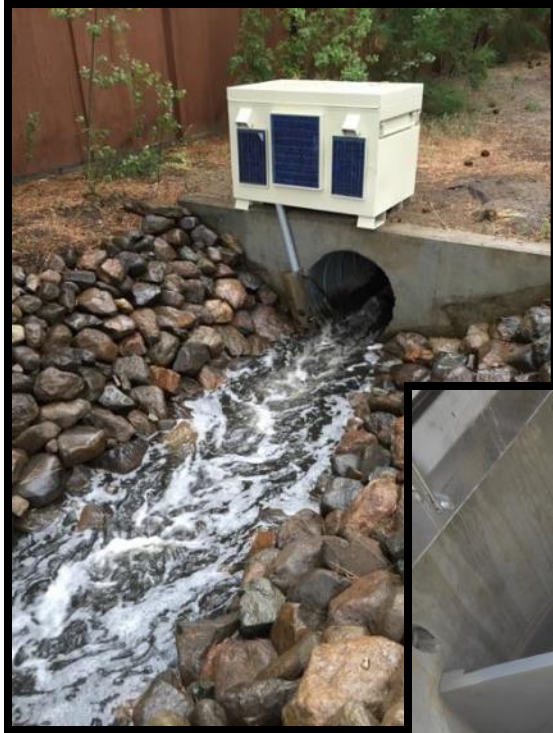
Watershed Outfall & Monitoring Site