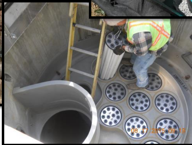
Jellyfish Filter Installation