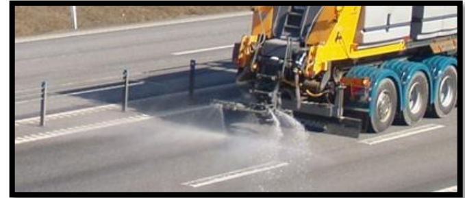
EPOKE Sand Spreader & Brine Applicator