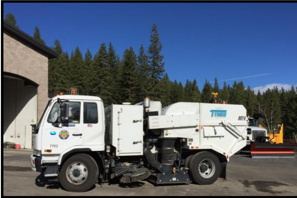
TYMCO Dustless Sweeper