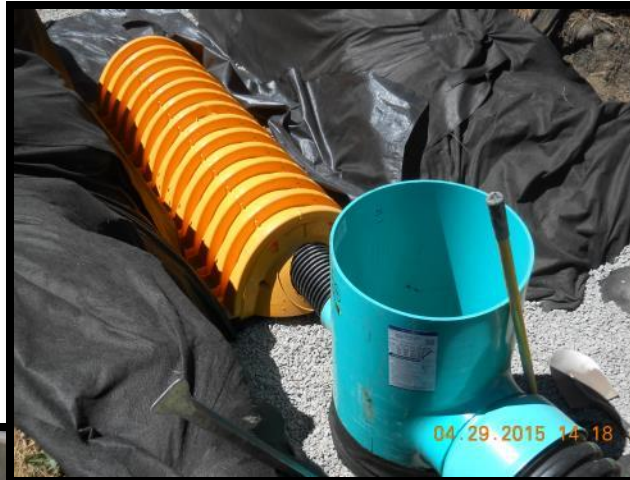
Sediment Can & Infiltration Gallery