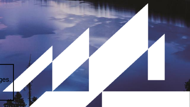
EXHIBIT B-1 - TAHOE Document consists of 10 pages. Entire exhibit provided. Meeting Date: 11-30-15

Innovation To Deliver Improvements and Services