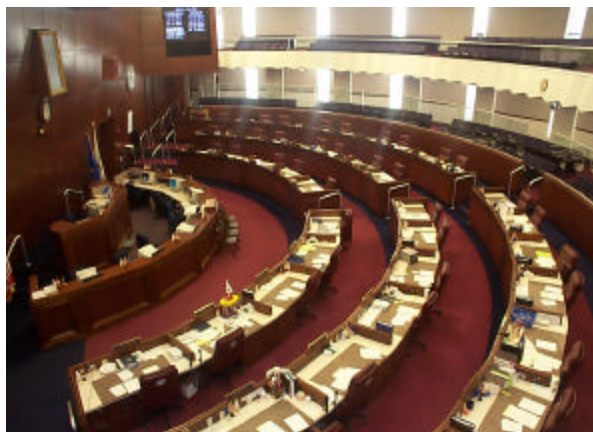
Nevada State Assembly Chambers

Nevada has been one of the fastest growing states in the nation during the past decade. In 1990, Nevada had a population of approximately 1.2 million. Current projections provided by the State Demographer indicate