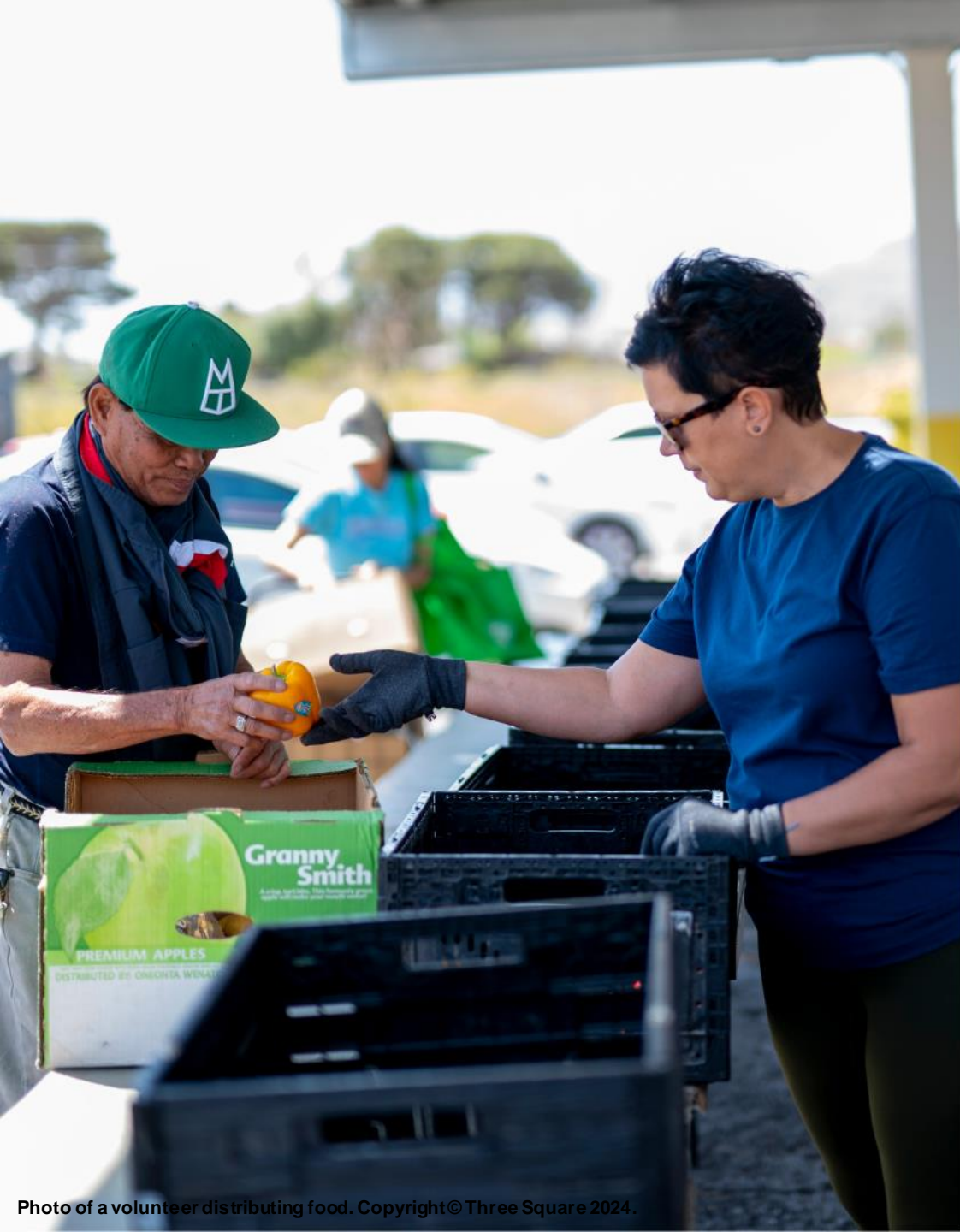
Photo of a volunteer distributing food.