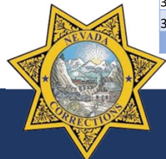
Chart is property of NDOC