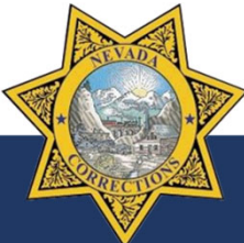
Chart is property of NDOC