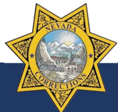
Chart is property of NDOC