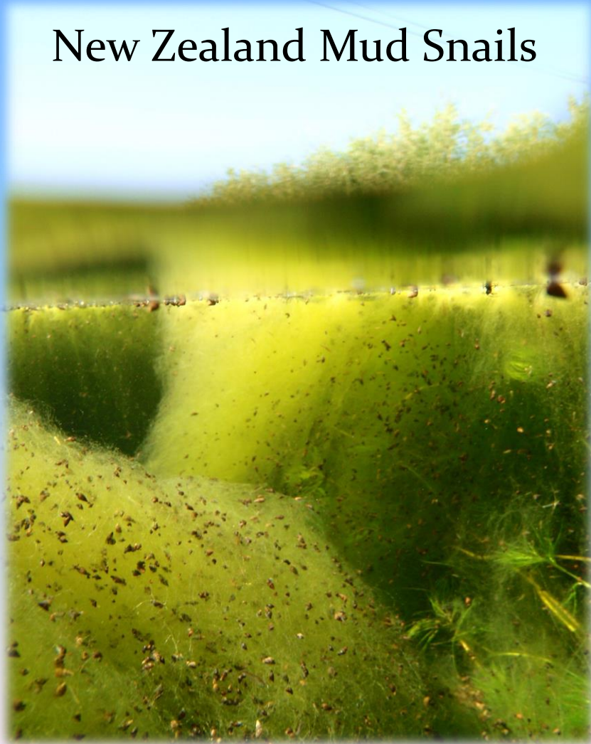
New Zealand Mud Snails