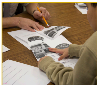
Students get help from their teachers to improve reading skills