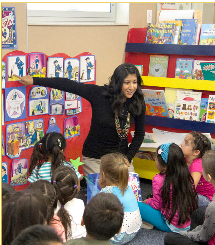
Interactive learning engages students in the classroom