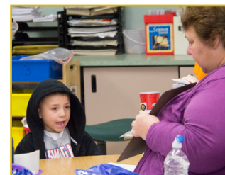
Below: Reading instruction during winter intersession