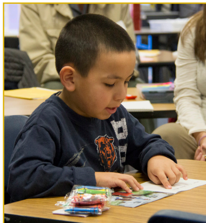
Student practicing early literacy skills

In addition to classroom instruction for Pre-K students, the Pre-K program provides ongoing parenting education that includes family literacy events, parent-child activities, and a variety of parent workshops. Parents set literacy goals, attend Family workshops and agree to increase Parent and Child Time (PACT) and reading time.