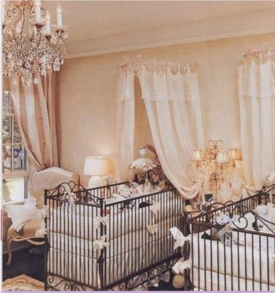
Jennifer Lopez's nursery