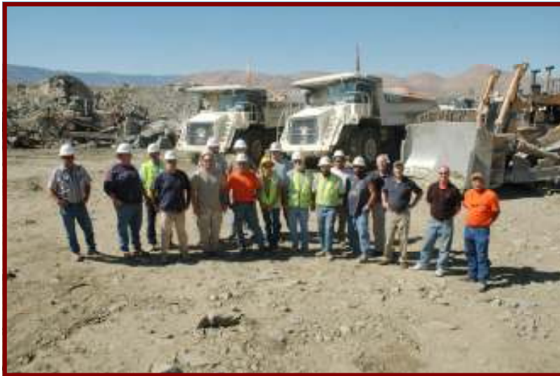
Carson City Airport—2008

The following are the companies and how many employees they had working on the Carson City Airport Project that was partially funded by the Nevada Aviation Trust Fund .