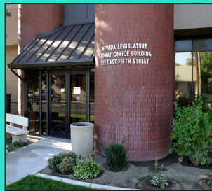
Sedway Office Building Carson City

In 1969, the Legislature created the Interim Finance Committee to function within the LCB between sessions and administer a contingency fund. This fund was set up to provide provisional funds for State agencies when the Legislature is not in session. The Interim Finance Committee also reviews State agency requests to accept certain gifts and grants, to modify legislatively approved budgets, and to reclassify State merit system positions in certain circumstances. The Interim Finance Committee is composed of the members of the Senate Standing Committee on Finance and the Assembly Standing Committee on Ways and Means.