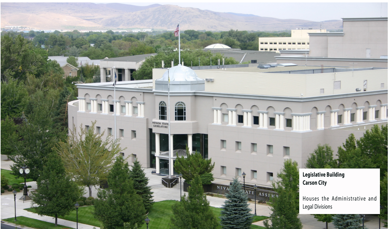
Legislative Building Carson City

Houses the Administrative and Legal Divisions