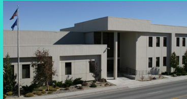
State Printing Office Building Carson City

Houses the Audit, Fiscal Analysis, and Research Divisions