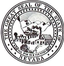
JOE LOMBARDO Governor