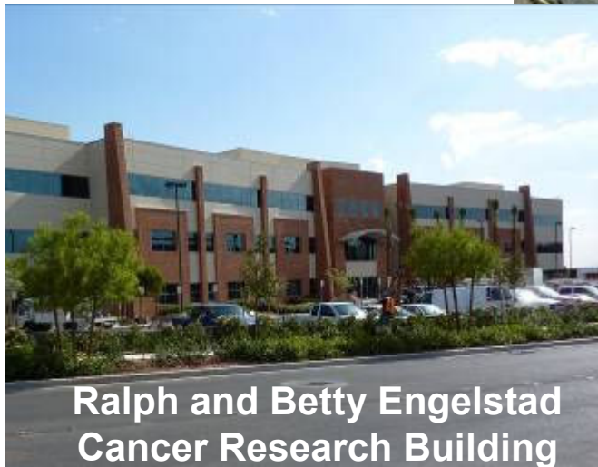
Ralph and Betty Engelstad Cancer Research Building