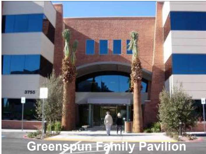
Greenspun Family Pavilion